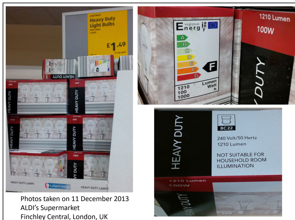
Figure 3. Example of an unscrupulous supplier circumventing EC No 244/2009 regulations

We have two specific responses to your questions in the public consultation: